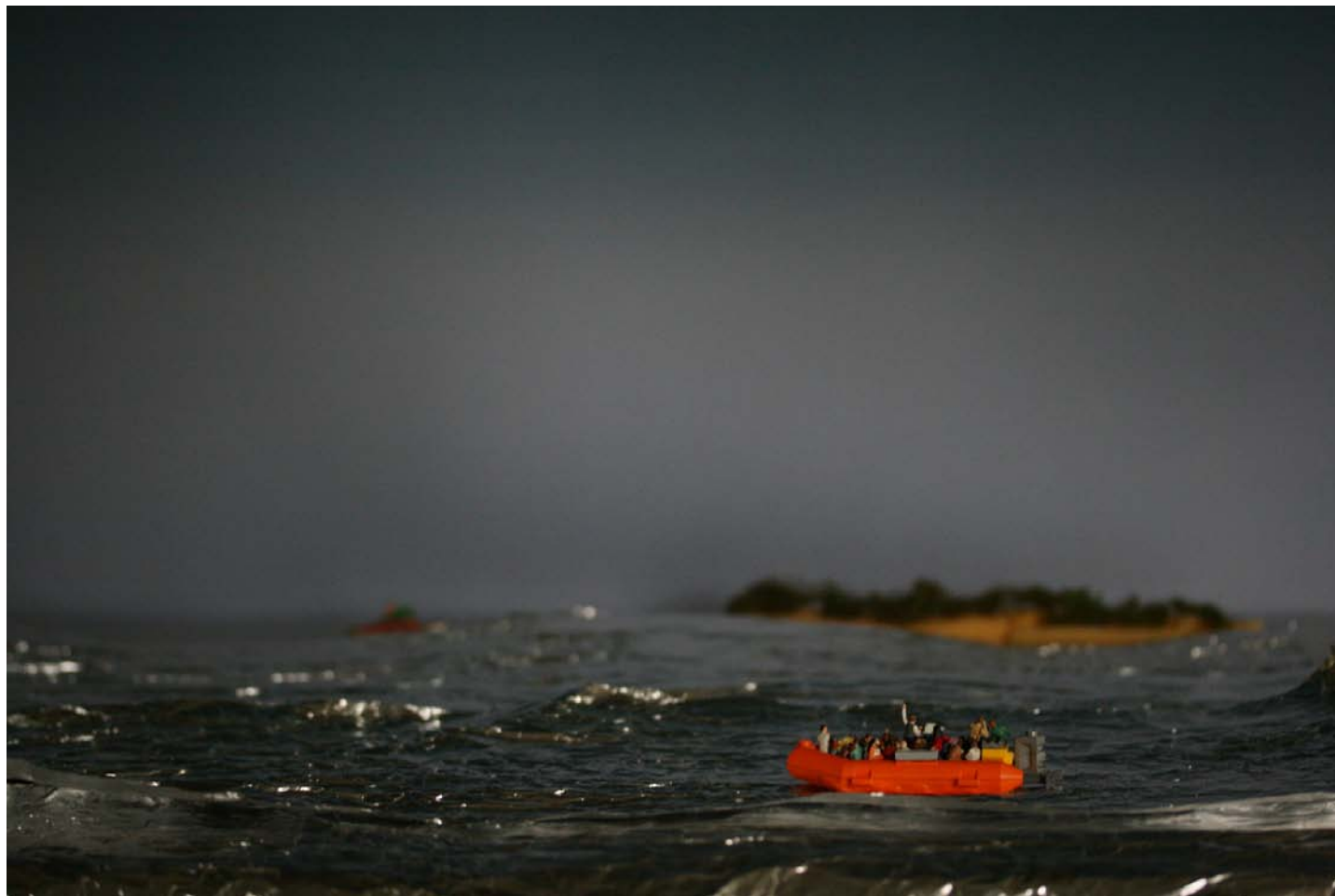
Lifeboat (sand atoll) 2017 pure pigment inks on 100% cotton rag 26 × 31.5 cm edition of 3 + 1 AP $800